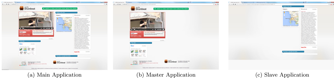
Figure 2: Splitting The Semantic Video Application Based On The Screen-Region Criterion

technique [7], to extend in JS some native browser functions with custom code, in particular: the 'createElement' function is extended to detect the creation of new elements and to trigger dynamically the mapping, annotation and splitting of these elements; the 'setAttribute' function to update the Mutation Summary configuration, to enable the mirroring of newly created attributes; and the 'addEventListener' function to overcome the limitation of the Mutation Summary library, and to replace an event handler triggered on the slave application to a call to the master application.