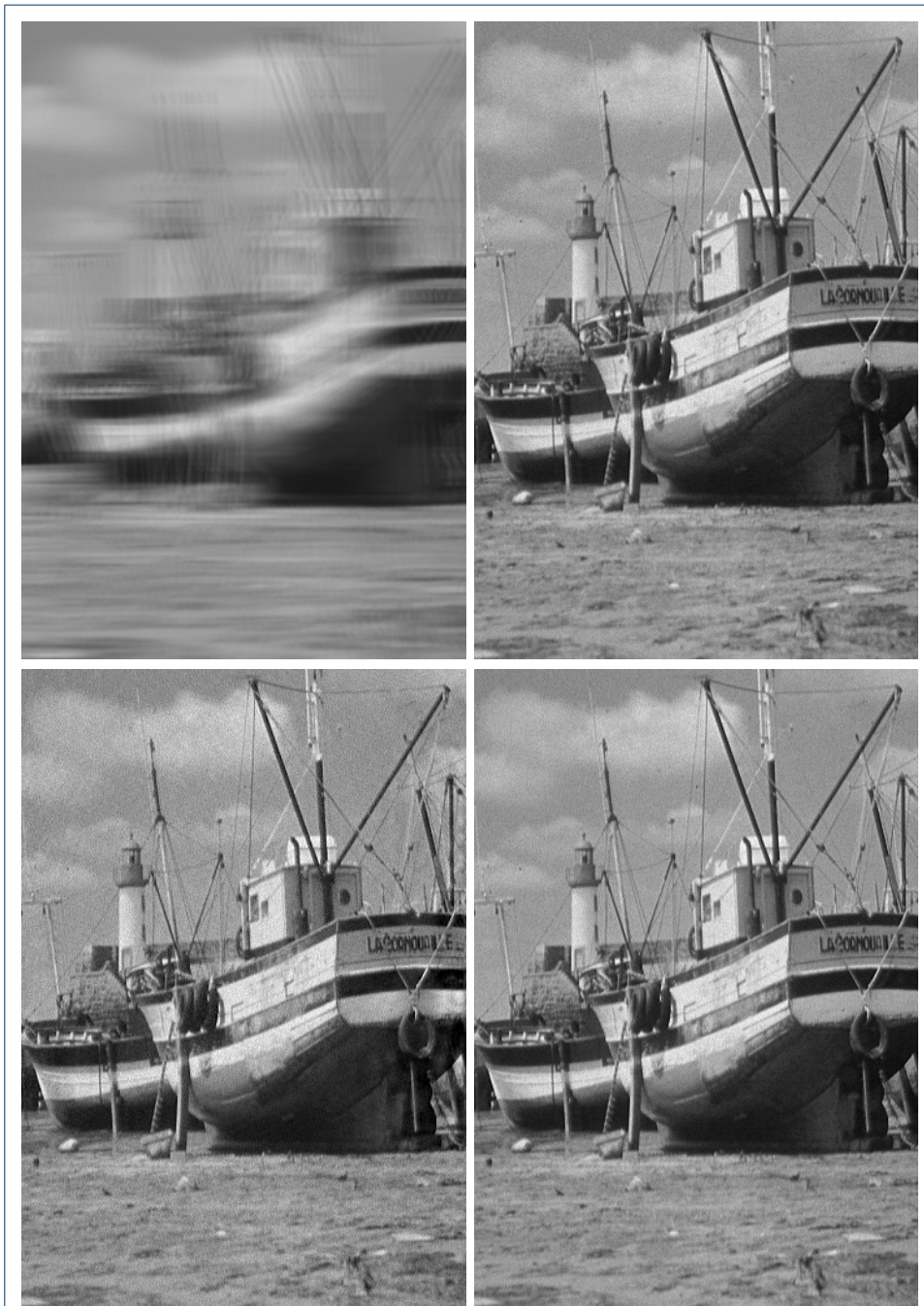
Figure 3 In this experiment, we assume that the scene s moves at velocity v = 1 pixel per second. The additive (readout) noise is Gaussian with a standard deviation equal to 10. We also assume that the scene emits 625 photons per seconds (for other values see table 1 page 17). On the top left panel: the observed image using the Agrawal, Raskar et al. code [5, 6]. On the top right panel: the observed image for snapshot an exposure time of 1 second, i.e., the blur support is 1 pixel. On the bottom left panel: the reconstructed image for the Agrawal, Raskar et al. code [5, 6]. On the bottom right panel: the reconstructed image for the snapshot (blur support of 1 pixel). This means that for the Agrawal, Raskar et al. code the blur has a support of 52 pixels. In other words, this code permits to increase the exposure time by a factor 52 compared to the snapshot. The RMSE using the Agrawal, Raskar et al. code is equal to 9.84. The RMSE of the snapshot is equal to 5.96. We refer to table 1 for different values of mean photon count and additive (readout) noise variance. This simulation is based on a variant of [29].