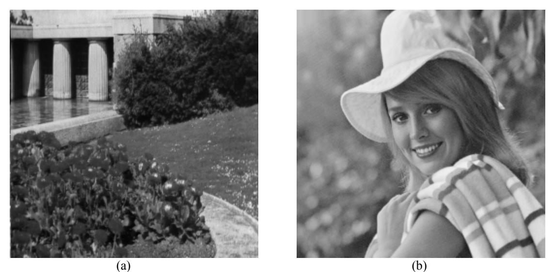
Figure1: Original "Flower" image (a) and original image "Elaine" image (b)

As we discussed in the previous sections, we can estimate and approach to the highest data rate by combining the watermarking embedding process and JPEG compression coding. The scheme was tested on the standard 256 \times 256 "Flower" and "Elaine" image, showed in Figure 1.