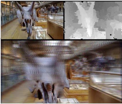
Figure 2 - Depth-based rendering on 5 views 3D display

In multiview mode, the player currently handles 3D content (BIFS/VRML/X3D), 2D scalable content (BIFS/SVG) with some extensions to provide depth information (as explained in [2]), video with depth map as used in MPEG-C [7] and image with depth map. Although still in experimental stage, this makes GPAC the first open-source multimedia browser with support for many 3D displays, including multiview auto-stereoscopic display.