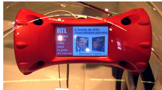
Figure 4 - GPAC on a T-DMB kitchen-radio