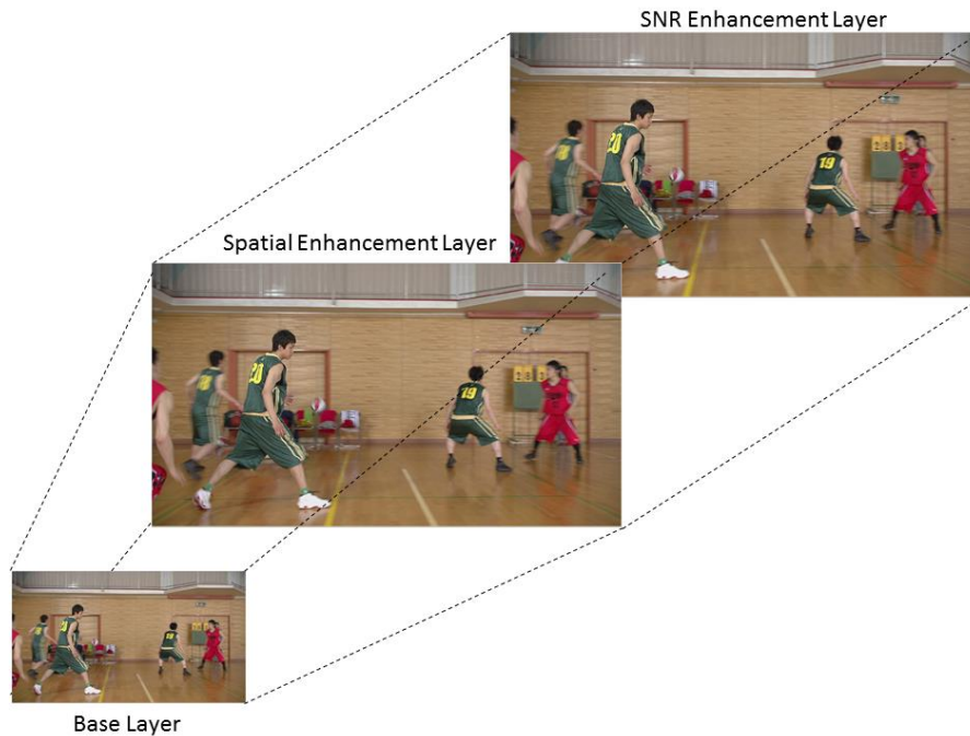
Figure 3: SHVC with 2 tile-based scalability layers

In this case, no more tiling is used. We again need to indicate dependencies between SNR and spatial layers. If each layer is defined through a visual sample group description with its own groupID, the technologies in the draft also works.